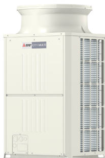
OUTDOOR VRF HEAT PUMP SYSTEM