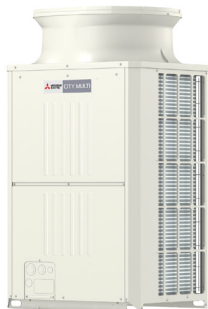
OUTDOOR VRF HEAT PUMP SYSTEM