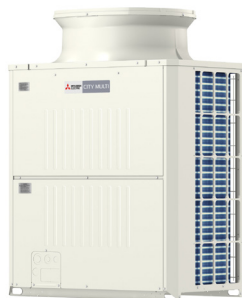
OUTDOOR VRF HEAT PUMP WITH HEAT RECOVERY SYSTEM