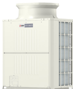
OUTDOOR VRF HEAT PUMP SYSTEM