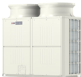
OUTDOOR VRF HEAT PUMP WITH HEAT RECOVERY SYSTEM